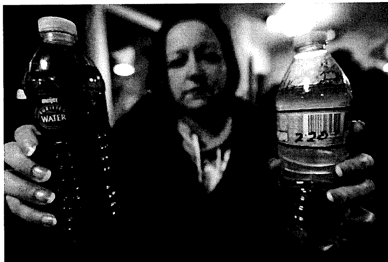
The Flint Michigan Water Crisis

Electronics: All electronics must be turned off during class unless a student has an accommodation approved by the Disability Services Office (see below). Please do not be surprised to hear me shout "turn off your cell phone" if I catch you peeking at it in class.